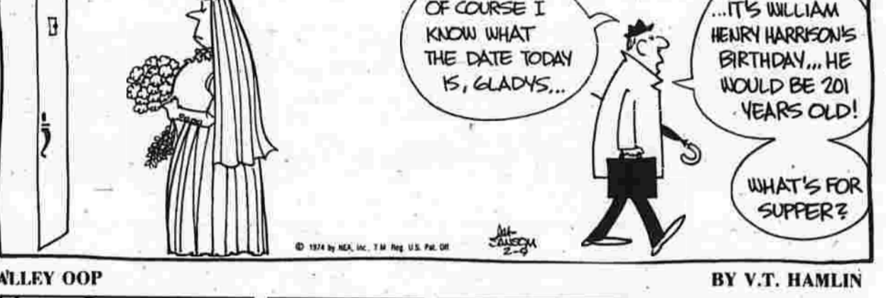
ALLEY OOP BY V.T. HAMLIN