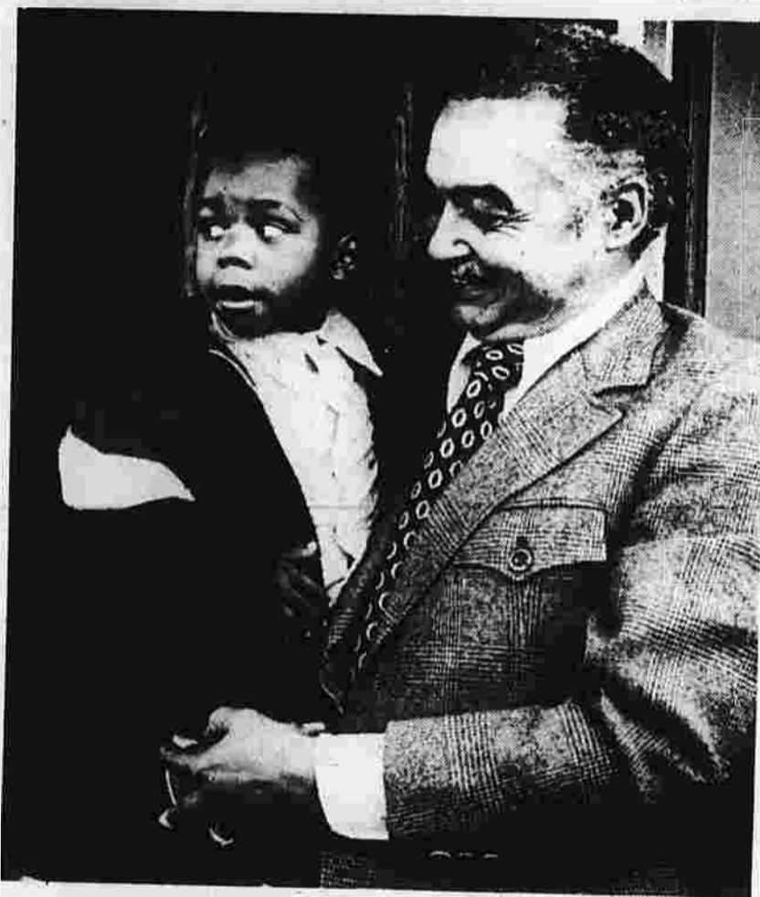
This picture was taken when Coleman Young was running for office. Mayor Young is divorced and has no children. People running for office often like to have their pictures taken with youngsters.

Black mayors have been elected to serve in some of our country's bigger cities including Cincinnati, Dayton and Cleveland in Ohio. Black mayors also serve in East Orange, New Jersey and Berkeley, California.