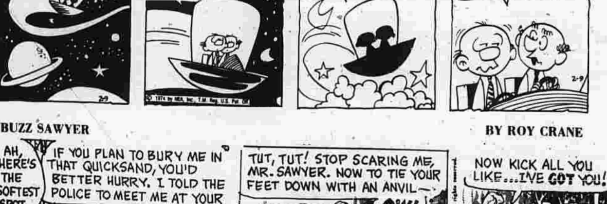
BUZZ SAWYER BY ROY CRANE