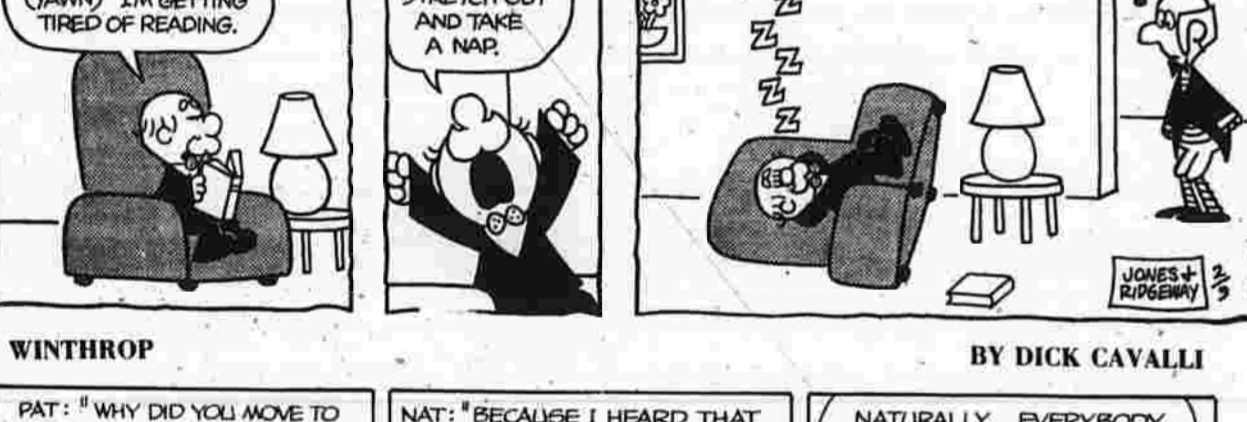
WINTHROP BY DICK CAVALLI